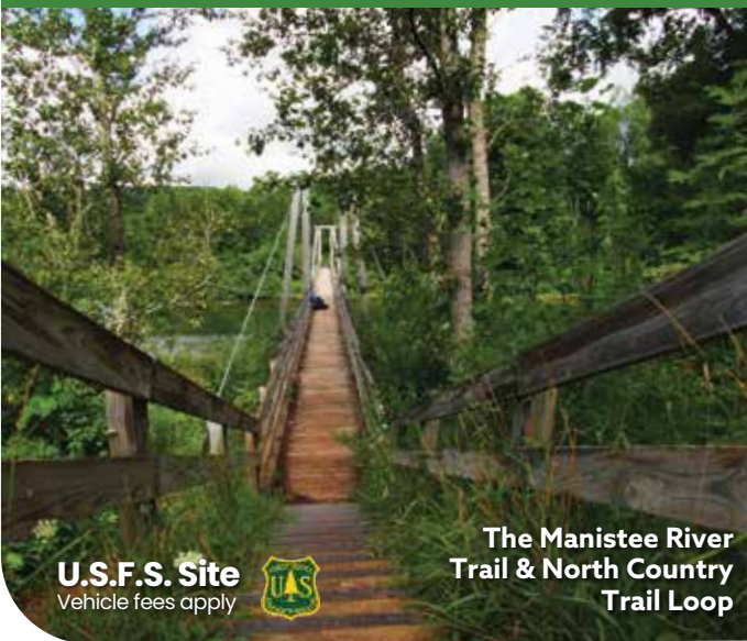
The Manistee River Trail & North Country Trail Loop