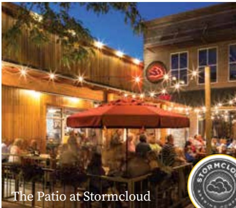
The Patio at Stormcloud

841 S. Pioneer Rd., Beulah 231-383-4262 | stambrose-mead-wine.com