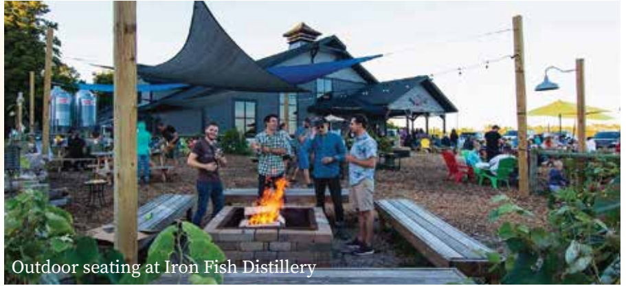
Outdoor seating at Iron Fish Distillery

Find all 12 stops sprinkled throughout the Manistee County Region. From craft cocktails, local ciders, and craft beer flights, please drink responsibly while you make your way around the entire region.