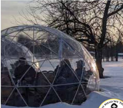
Winter Igloos at St. Ambrose