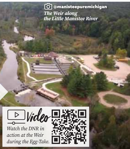
@manisteepuremichigan The Weir along the Little Manistee River